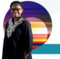
Judy Gichoya, et al. AI recognition of patient race in medical imaging: a modelling study. The Lancet . 4, June 2022:e406-e414.